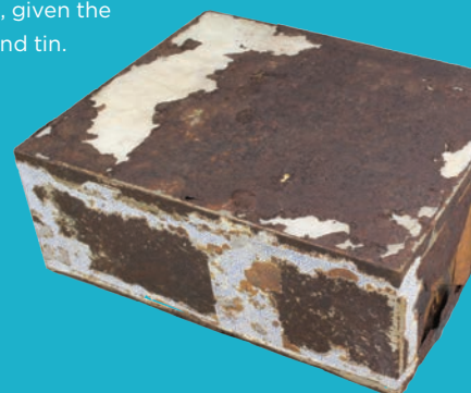
» Fruit cake.

Finding such a perfectly preserved fruit cake was quite a surprise. It is an ideal energy food for Antarctic conditions, and is still a favourite item on modern day trips to the Ice.