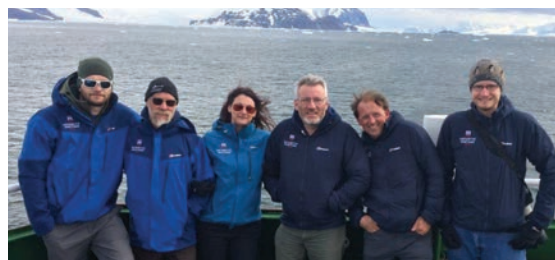
» Top: 'Base E' on Stonington Island, Antarctic Peninsula. Right: Conservation team on the HMS Protector.

This project is part of the developing relationship between the two trusts, and follows on from a previous initiative in February 2017, when Al assisted the UKAHT to complete a building survey of Hut Y, at Horseshoe Island on the Antarctic Peninsula. The team look forward to continuing this work with UKAHT next season.