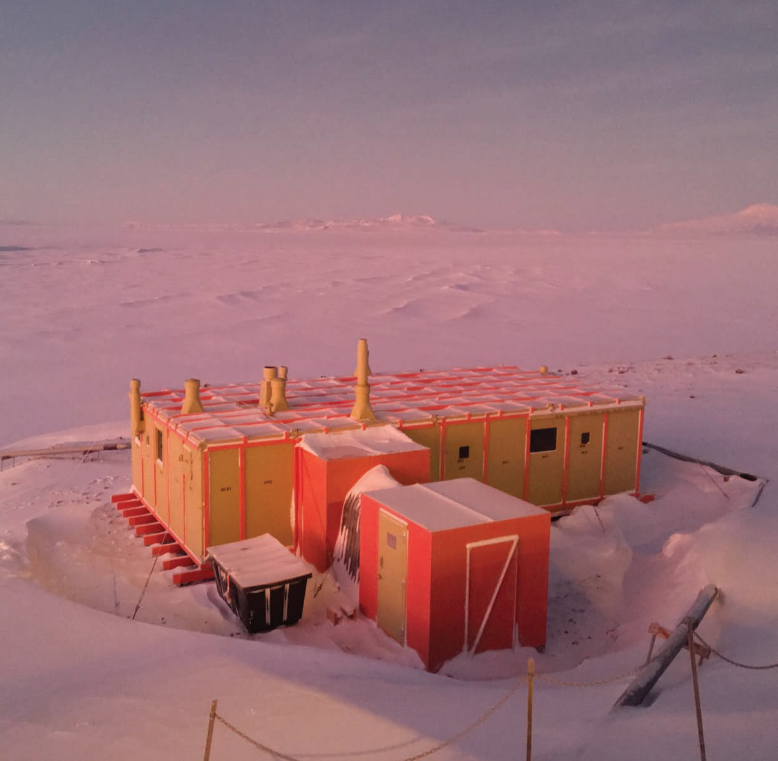
» Hillary's (TAE/IGY) Hut 2018.