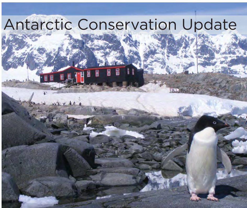
Base A at Port Lockroy.

Antarctic Heritage Trust has a busy conservation season ahead working across Ross Island heritage sites, at Cape Adare and with UKAHT on the Antarctic Peninsula.