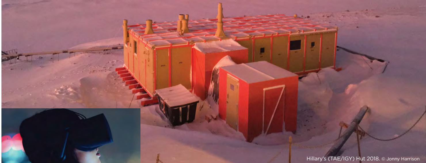
Hillary's (TAE/IGY) Hut 2018.