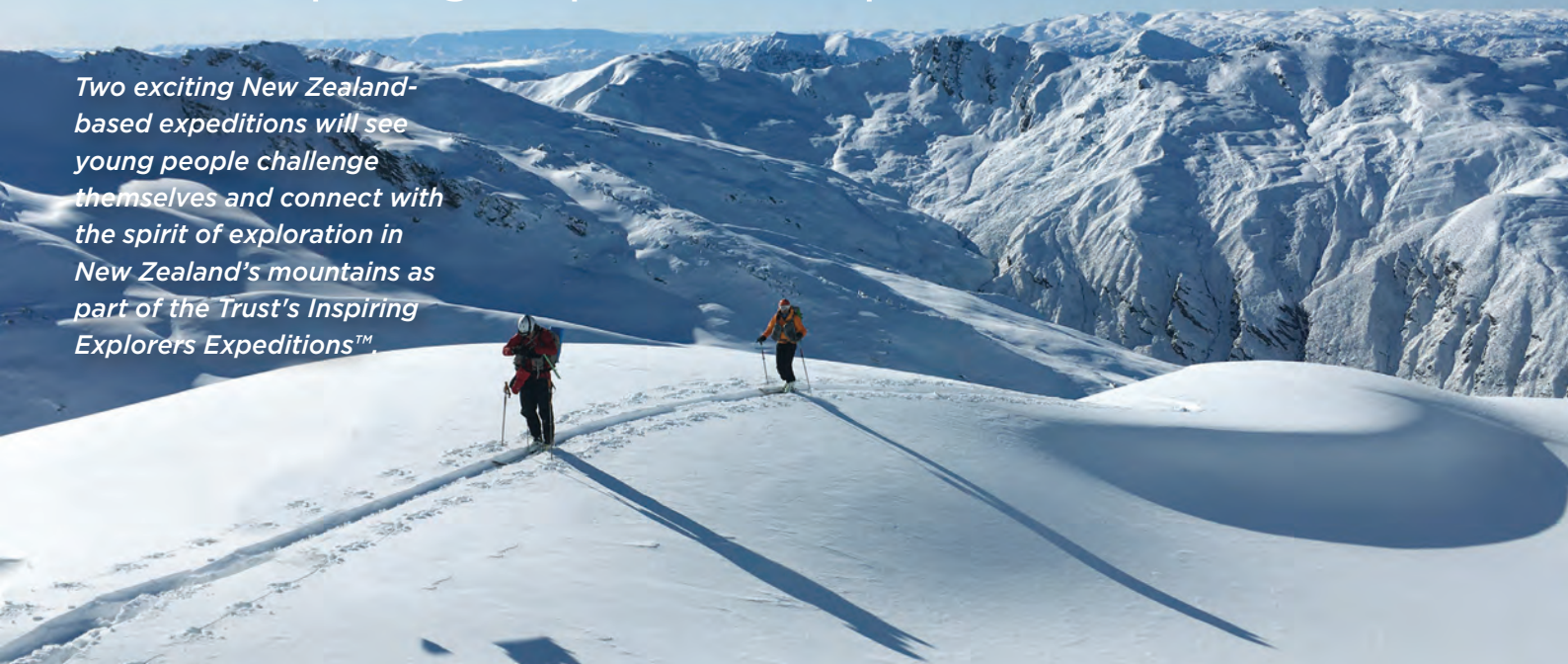
Skiing the Mahu Whenua Traverse.

Two exciting New Zealand-based expeditions will see young people challenge themselves and connect with the spirit of exploration in New Zealand's mountains as part of the Trust's Inspiring Explorers Expeditions™