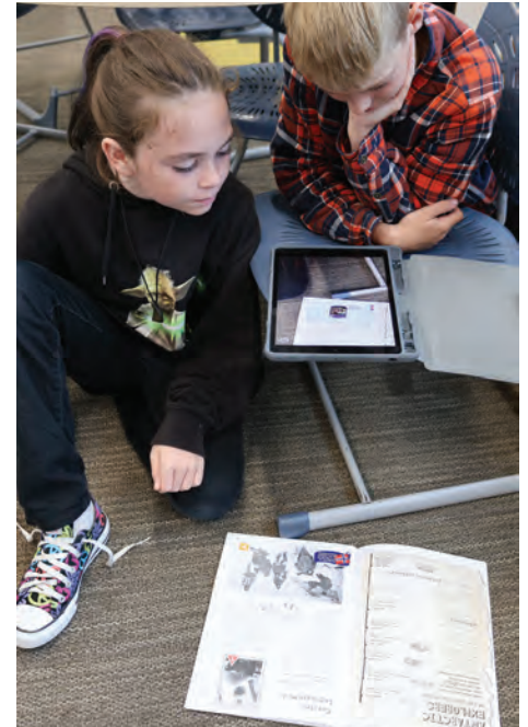
Students watching a video with the app.

To capture the Antarctic 3D artefacts the