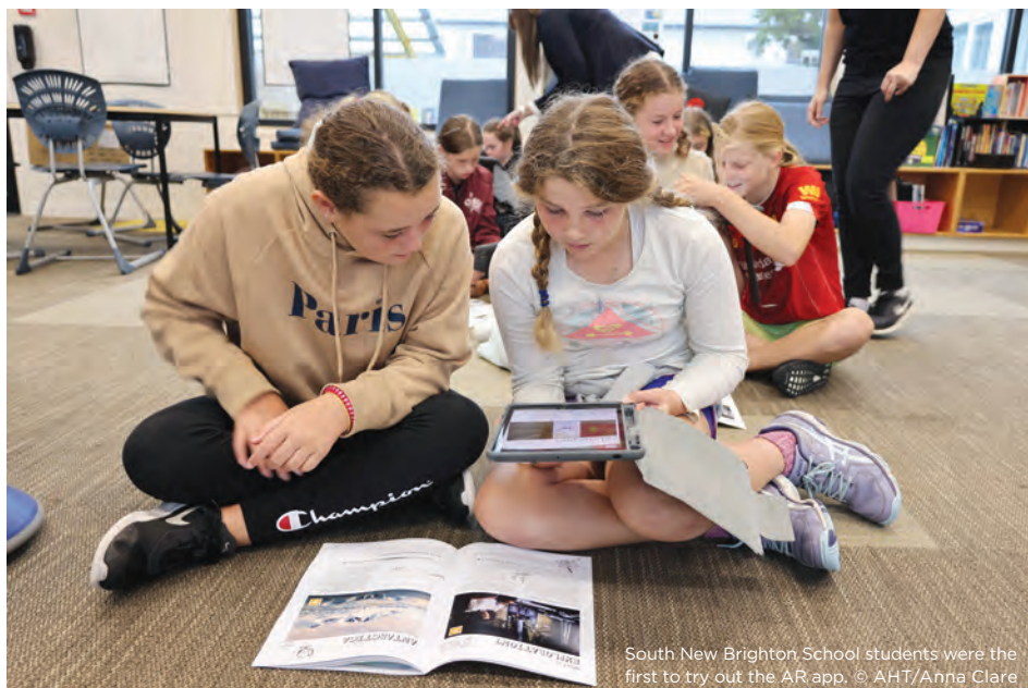
South New Brighton School students were the first to try out the AR app.