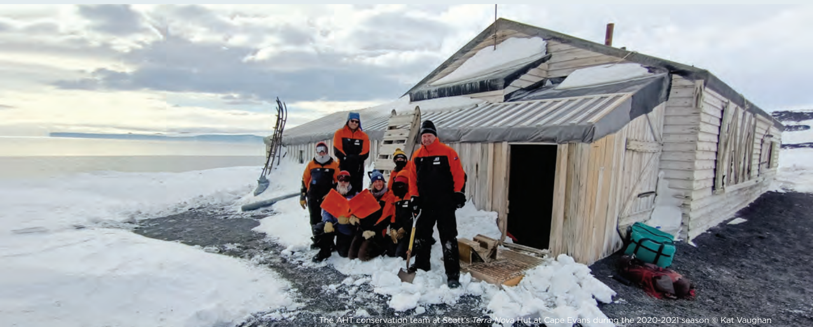
The AHT conservation team at Scott's Terra Nova Hut at Cape Evans during the 2020-2021 season

Meanwhile, we plan to continue our programme assisting our sister Trust UKAHT conserve the historic sites of the Antarctic Peninsula.