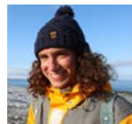
Anzac Gallate.