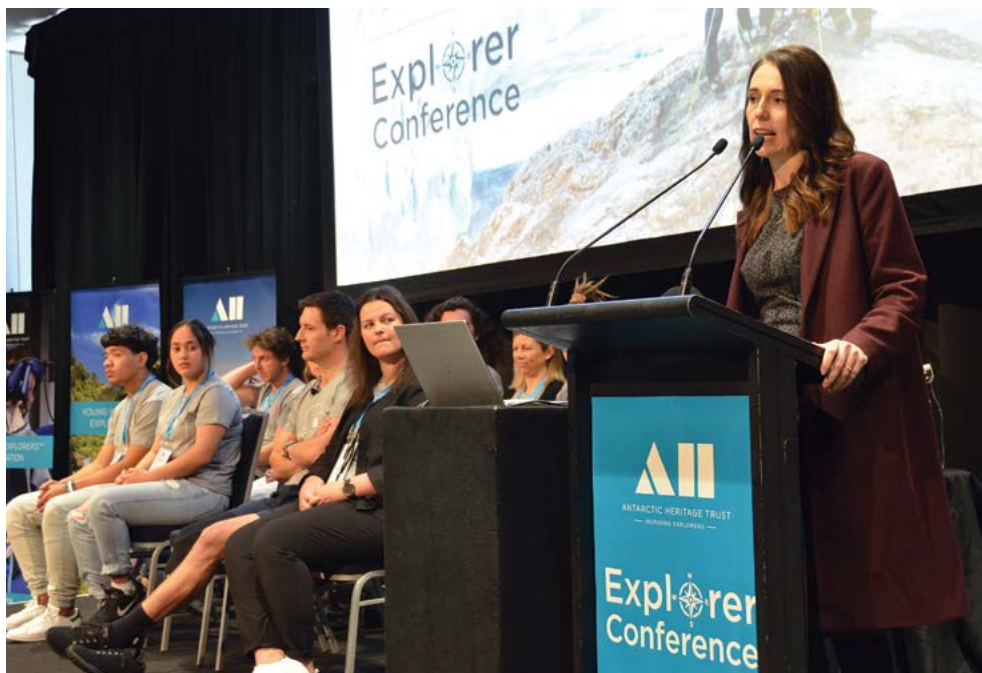
New Zealand Prime Minister Rt Hon Jacinda Ardern officially opening the inaugural Explorer Conference.