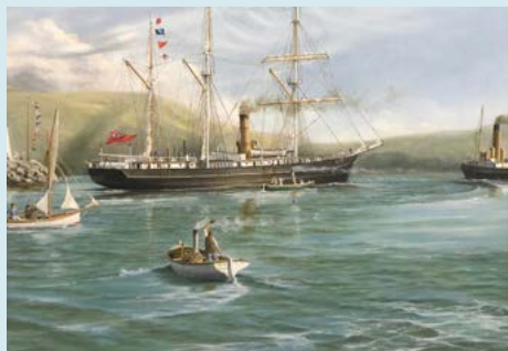
Detail showing Shackleton's Nimrod departing Lyttelton 1908 by Sean Garwood. © Sean Garwood

Trust supporter Sean Garwood's exhibition 'A Painted Voyage' will be held at the Jonathan Grant Galleries, Auckland, New Zealand from 9 to 24 October 2021. The paintings featured in this exhibition, represent the most comprehensive visual survey of New Zealand's rich and diverse maritime history ever assembled in a solo exhibition. Featured in the exhibition will be Shackleton's Nimrod departing Lyttelton in 1908.