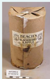
Examples of the diverse range of images in the Trust's digital collection. Left: The 2017 Inspiring Explorers Expedition™ team on the summit of Mount Scott, Antarctica. Right: Images of a jam jar before and after conservation treatment.