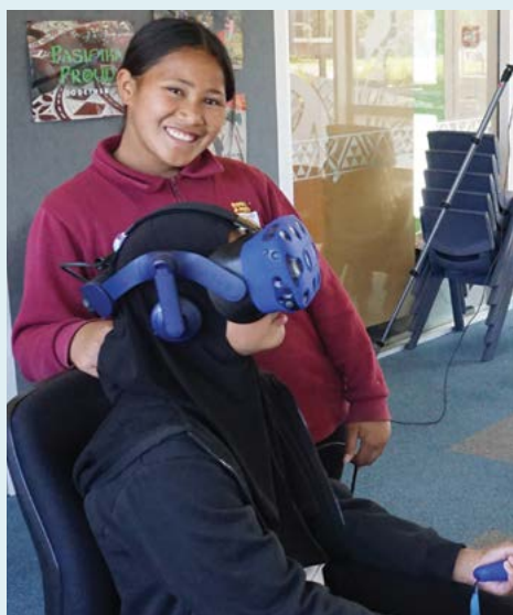
Students at Rowley School, Christchurch enjoy the VR experience.

More information on how to support the Trust can be found on our website. nzaht.org