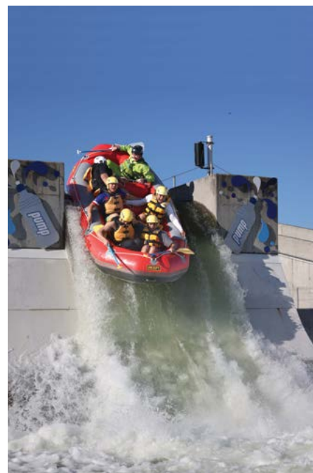
Students whitewater rafting at Vector Wero Whitewater Park.