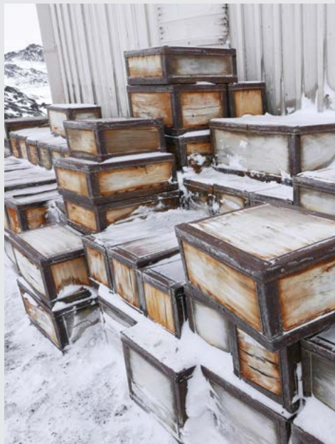
Work on the Venesta store cases at Shackleton's Hut at Cape Royds will be part of the upcoming season's deferred maintenance programme.

At Scott's Cape Evans Hut, the main task will be to reduce the level of environmental contaminants in the stables and western annex, which are a risk to the artefacts there. At Scott's Discovery Hut at Hut Point, a solution has been developed to overcome the issue of blubber oil seeping into