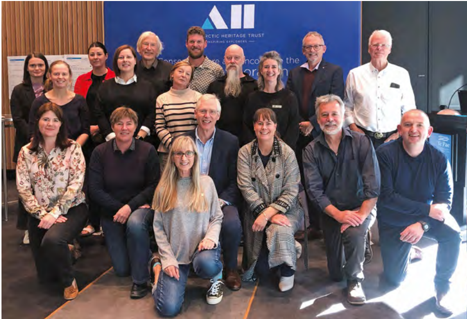
2023 Conservation Management Plans workshop participants.