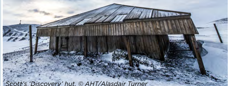
Scott's 'Discovery' hut.

We are grateful to have received some funding from Manatū Taonga Ministry for Culture and Heritage Cultural Sector Regeneration Fund. The Trust is working with StaplesVR to develop the experience, which will open up virtual access to this historically significant site.