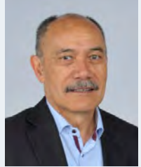
The Rt Hon Sir Jerry Mateparae.

We are delighted to announce that Rt Hon Sir Jerry Mateparae GNZM QSO KStJ has joined the Trust's Board as an Independent Trustee. Sir Jerry served as the 20 th Governor-General of New Zealand from 2011-2016 and subsequently as the 27 th New Zealand High Commissioner to the United Kingdom from 2017-2020.